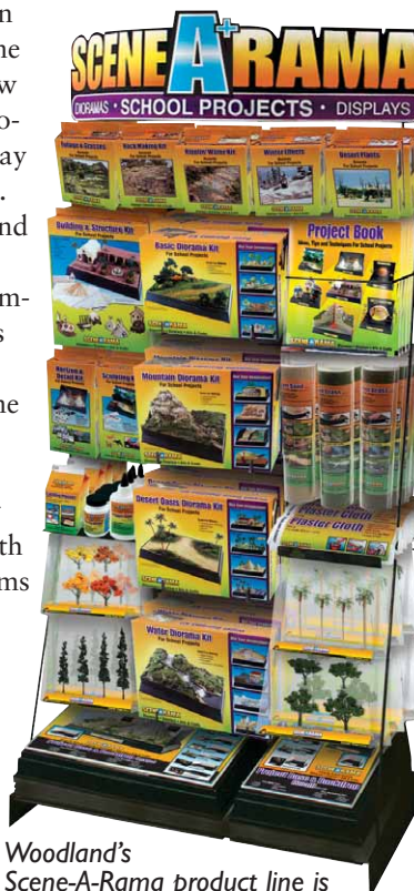
Woodland's Scene-A-Rama product line is available in several configurations. Dealer's best bet is this all-inclusive Scene-A-Rama Merchandiser.

Dealers can order Scene-A-Rama products from their favorite distributors in singles or case quantities, although the most effective store display is the Scene-A-Rama