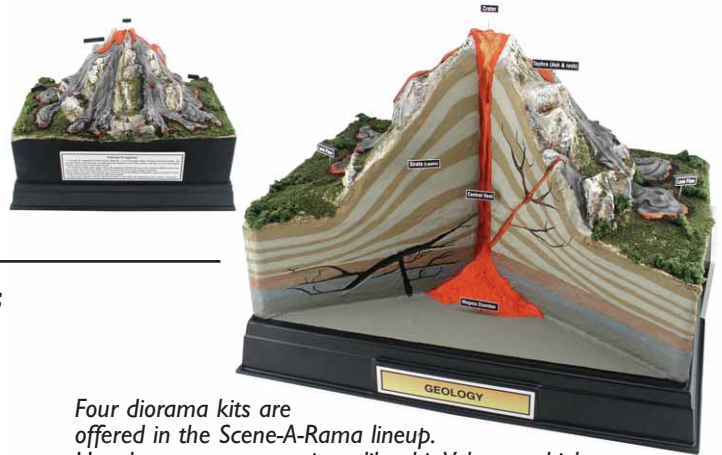
Four diorama kits are offered in the Scene-A-Rama lineup. Use them to create projects like this Volcano, which reveals geological information beneath its removable face.

Customers start their projects with a Scene-A-Rama Project Base and Backdrop, which assemble into beautiful showcases for their completed displays or fully detailed dioramas. Using the versatile Scene-A-Rama Diorama Kits and Accents, they can create scenes from prehistoric times, ancient Egyptian or early American