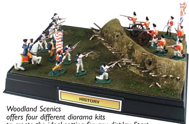
Woodland Scenics offers four different diorama kits to create the ideal setting for any display. Start with the base and backdrop, then add surface details like ReadyGrass, trees, shrubs, sand, dirt, gravel, water, even snow.

Handling the new Scene-A-Rama line from Woodland Scenics presents your store with an opportunity to serve a broad consumer base of students and crafters, and even hobbyists that are not necessarily model hobbyists. The line includes several product categories and sub categories, and each one complements the others in the mak-