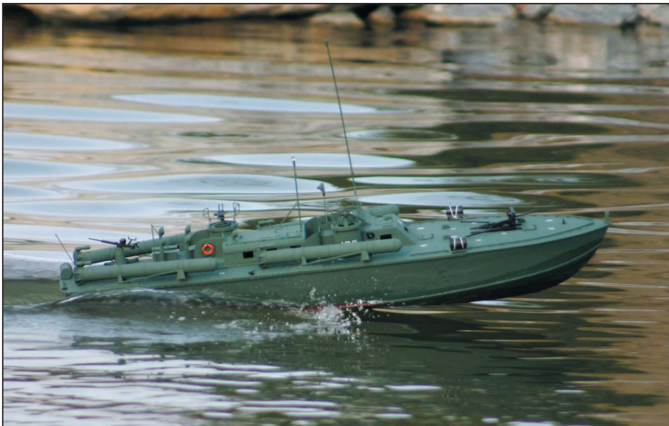
The Pro Boat PT-109 gets on the step quickly and turns tightly. Great handling and good speed make this scale boat fun to drive.

Pro Boat has created a versatile, great-handling and fun-to-run tribute to PT-109, a U.S. Navy superstar. HM