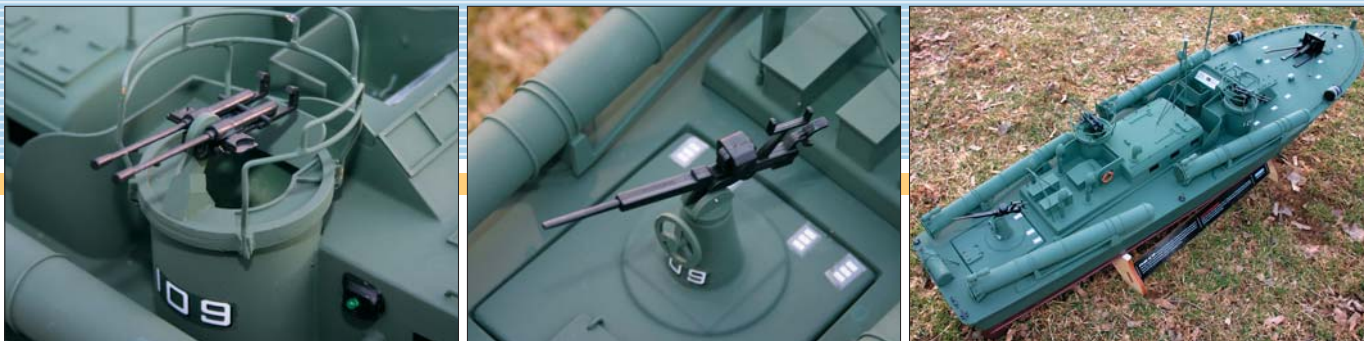
The 40-inch-long PT-109 EP is loaded with convincing deck detail. Two deck guns are ready for owner-supplied crewmen figures, and the four torpedoes can be quickly rotated from the stowed, running position (port bank) to angled outward and fire-ready (starboard).

the scale details. The first details to attach are the torpedoes, which are retained by short lengths of fuel tubing over their rear studs. No glue is needed. The rear mast slides into a tube on the rear deck, the scale antenna is inserted into a hole on the side of the driver's cabin, and the spotlight slides into a second tube next to the driver seat. The navigation light/mast assembly is inserted into the forward hatch, threading the wires for the working light through the holes in the cabin. Solder or twist the wires together, then use heat-shrink tubing or electrical tape to insulate the connections.