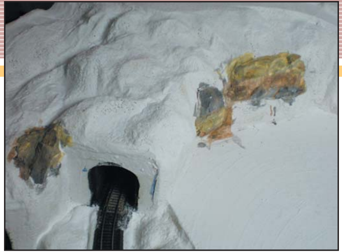
5. Use a thinly mixed water-and-black wash applied over the coated rock castings to "age" them, and further blend the colors.