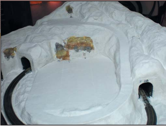
4. Burnt umber and black color washes are applied next, overlapping the yellow ochre and completely covering the castings.