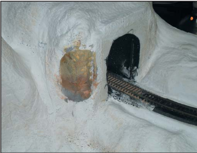
6. Rock formations are starting to look good, but the tunnel portals are still in their raw form, and will soon be similarly coated.