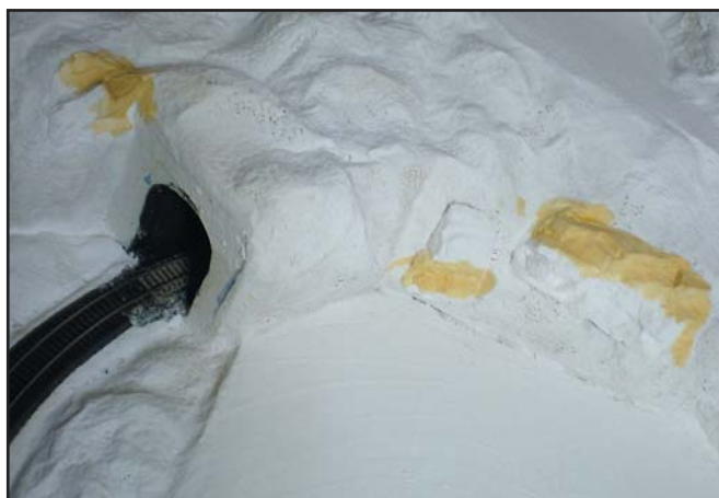
3. Small runs are not a problem; just get the color applied. This is actually one case in which neatness positively does not count.