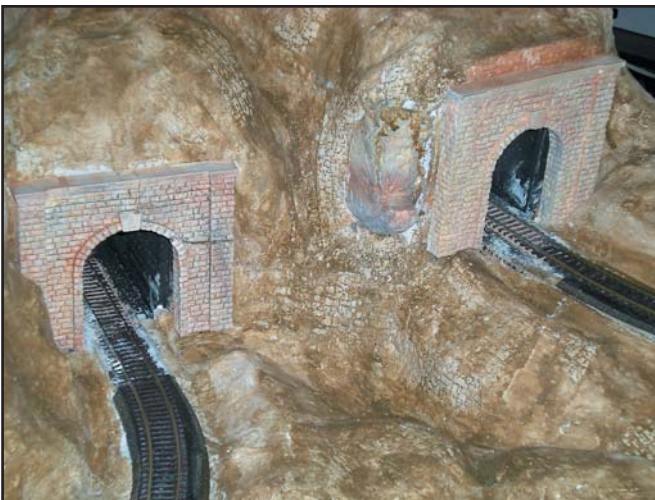
8. Light washes of rock color highlight the portals, then more Earth Undertone is used to darken and highlight random areas.