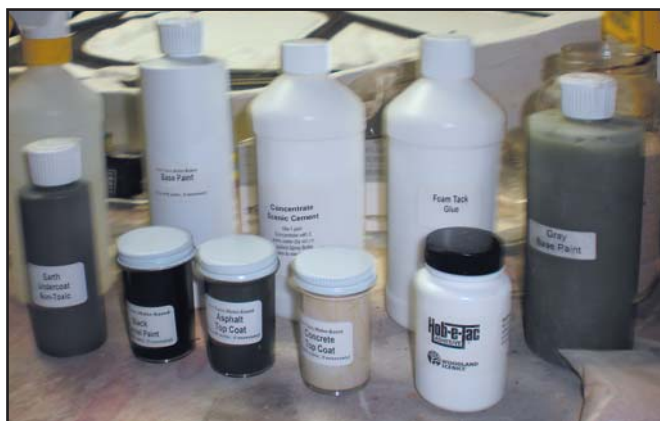
Grand Valley comes with an impressive collection of scenicking supplies, including all the adhesives, brushes and applicators.