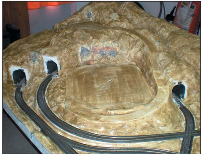
7. Brandon adds one cup of water to the Earth Undercoat, then paints it over the whole layout, but not over the painted rocks.