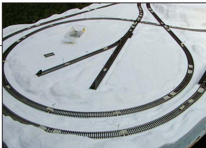
SubTerrain base and Plaster Cloth cover completed, track is laid and the HO-scale Grand Valley Railroad is ready for scenicking.