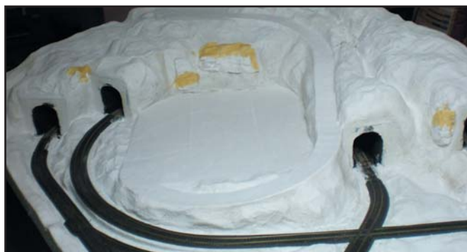
2. Starting with Woodland's yellow ochre, Brandon applies a light coat of color to roughly a one-third area of the rock formations.