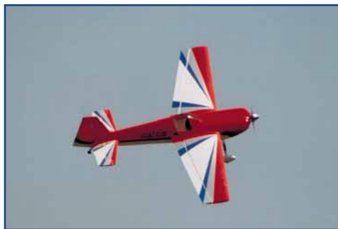
Hangar 9's Edge 540 entering knife edge.

together; much greater care and attention is involved with the assembly of an airplane as large as this, and my first step would be the installation of the aileron servos and extensions, then I would sand all the Robart Super Hinge Points and install them with Hangar 9 12-Minute Epoxy.