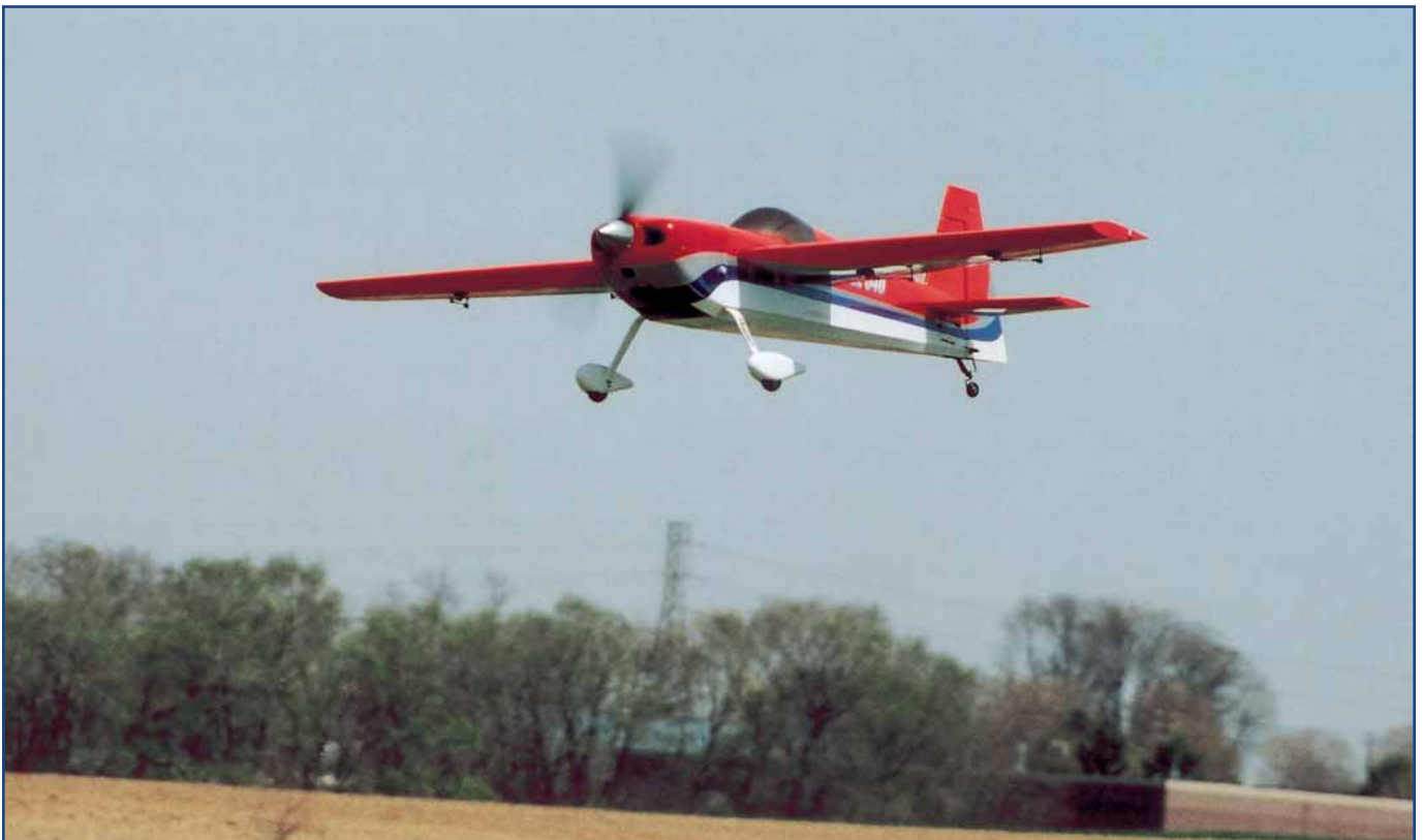
Hangar 9's 33 percent Edge 540 performs a slow flypast over the runway at Lancaster County RC Club flying site in Pennsylvania.

For more information about the hangar 9 33% Edge 540, the Zenoah GT-80 horizontal twin and the JR 10X RC system, see the ads on pages 5 and 53, or telephone Horizon Hobby at 217-352-1951. HM