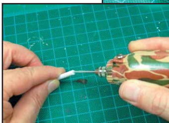
Chassis detail abounds on Trumpeter's Eagle. Prominent are the Hale 2000 GPM pump with the 6-inch side intakes, the drive train, rear differential and suspension. Tom Grossman uses K&S Hobby Drill and the round burr from the accessory pack to hollow the end of an exhaust pipe.