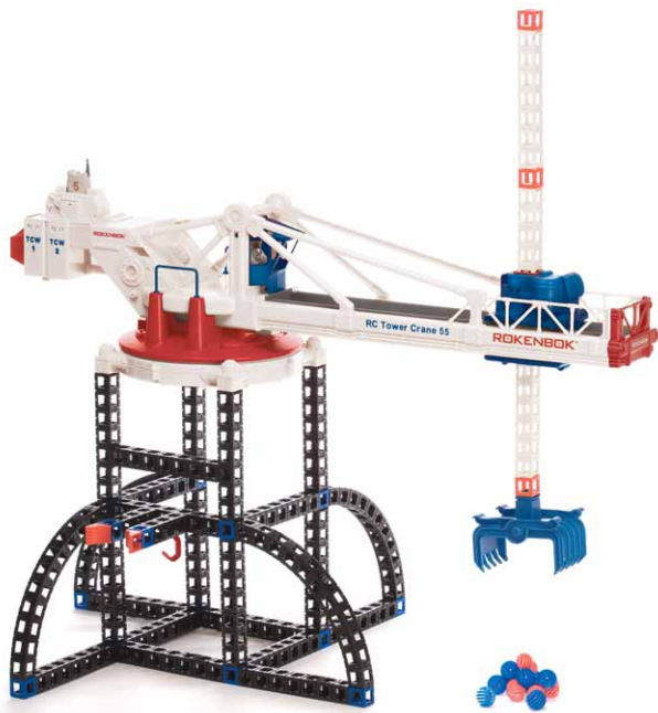
Rokenbok's RC Tower Crane features multiple attachments for handling ROK balls and other accessories.

tem including the Radio Control Center, Control Pad and Radio Keys for up to eight vehicles. Then, depending on individual interests, add-on vehicles, building sets and accessories can be added, allowing you to customize the system in any way you choose.