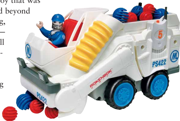
Rokenbok's radio-controlled Loader drives forward and back, turns right and left, and unloads ROK balls into the Motorized Conveyor.

The Rokenbok construction system shares many characteristics that are common to traditional hobby-related products. First, you buy one of four different Rokenbok Start Sets, complete with everything needed to use the sys-