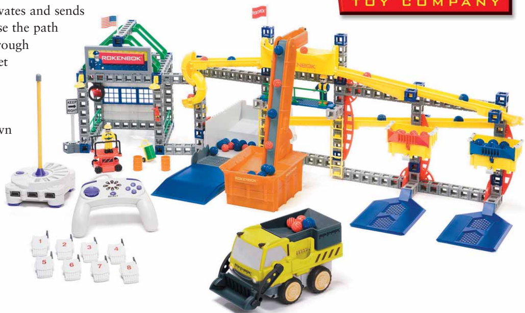
As with all Rokenbok products, the radio-controlled Conveyor Company is brilliantly engineered for creative play sessions, and ruggedly constructed for exceptional durability.

Equipped with over eight feet of track, 2-1/2 feet of chutes, a Power ROK-Lift with 30 inches of vertical lift,