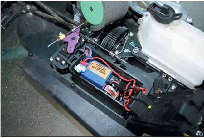
Despite its four-channel capability, Airtronics receiver is able to fit into common two-channel locations.

ming buttons. The M11's screen has no printed words, just a cursor that moves around. The entire screen is blank when powered down, a feature that I really like. It makes programming easier since you can see the menu titles better, and using less space on the screen gives users a larger viewing area for the programming menus.