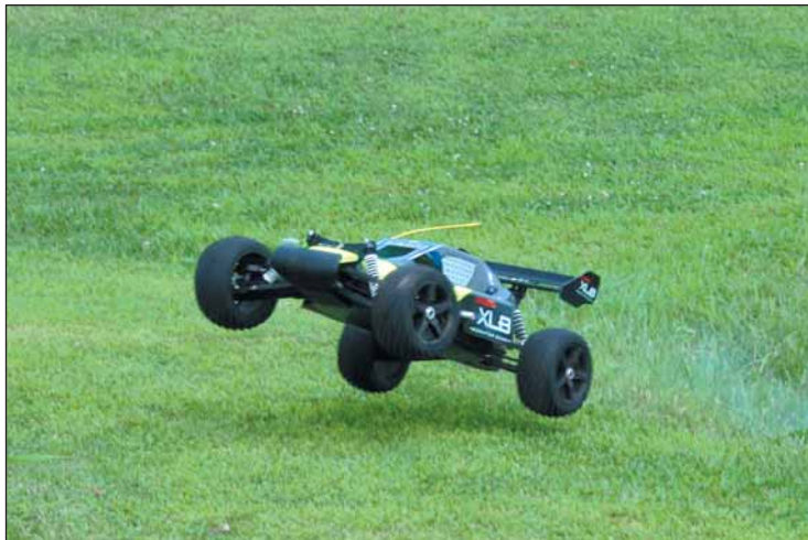
It all works. The M11 is an outstanding surface RC system, able to deliver anything today's competition racer needs.

The M11 transmitter case can be easily changed from right-hand to left-hand operation, and the spring tension is also adjustable. The many but-