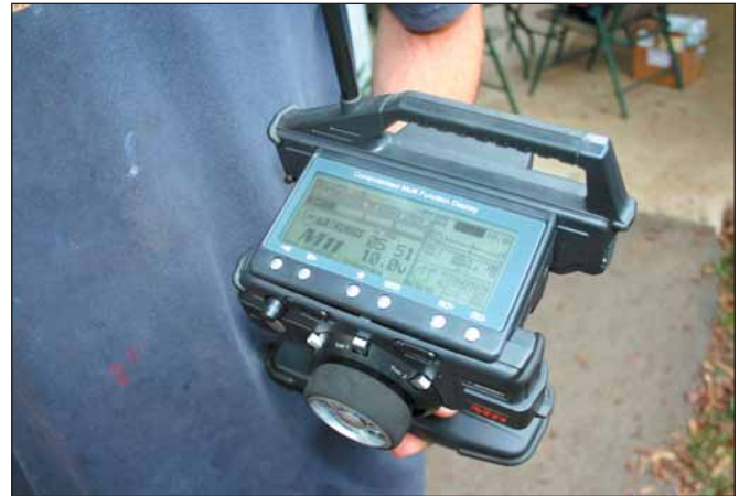
M11's LCD readouts are large. Once you know what to look for, they're easily visible at a quick glance.

Here are some of the additional M11 features not found on most other radios. You can reduce the speed of the steering and throttle servos to suit your driving style. One of my trucks has overly effective brakes, and by using the adjustable speed reduction feature, I've eliminated my overpowering brakes and made the vehicle much easier to drive fast, and turn faster lap times.