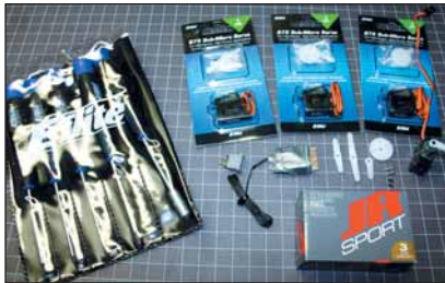
E-flite's new S75 servos and JR SPORT receiver are in HM's review model.

I chose my JR XP6102 computer transmitter and four of E-flite's new S75 sub-micro servos for my Mini Edge 540. These new servos are rated at 17.2 ounces at 4.8 volts, and their transit time is only .12 seconds. Each servo comes with two mounting screws and a handy collection of servo output arms, including a reinforced, extra length arm, which is required for almost every contemporary small electric model produced for 3D flight. I installed one S75 servo in each wing panel for the ailerons, another in the tail for elevator, and a fourth inside the fuselage cabin for the pull-pull rudder system. The pull-pull rudder is a very nice feature of the E-flite Mini Edge 540 3D.