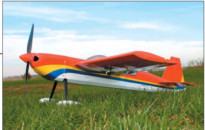
E-flite's Mini Edge 540 is a fully built-up balsa and lite-ply ARF.

My power system consists of an E-flite 400/4200KV Brushless Motor and an E-flite 20mm by 20mm Heat Sink, one of the newer E-flite 20-Amp Brushless ESC's, and a Thunder Power 11.1V 2100mAh LiPoly battery. I charge this setup with E-flite's compact Celecra DC charger, which is an ideal unit for charging 1-to-3-cell LiPoly motor packs.