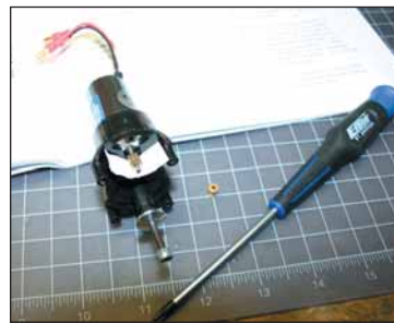
Small piece of paper is used to set motor for proper gear backlash.

E-flite's Mini Edge 540 is a great build. Throughout its assembly, I found myself continually amazed by the model's exceptional wood quality, clean laser cutting, drum-tight UltraCote covering and quality included accessories. Nothing in the box is "throw-away" fill; every fastener, every piece of control linkage, the painted glass cowl and wheel pants, landing gear legs and every other part of this model are all top shelf.