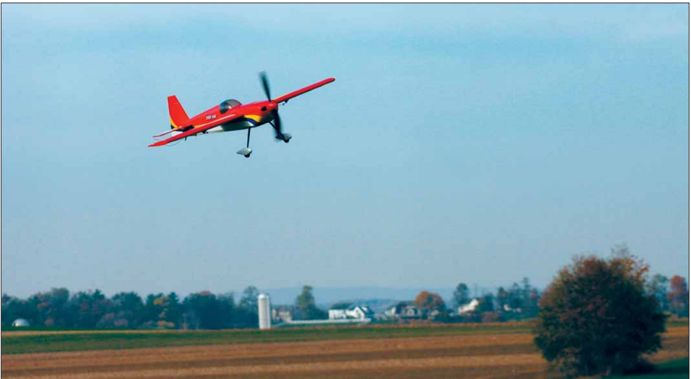
It's hard to believe that this model spans less than 40 inches. Mini Edge 540 3D from E-flite by Horizon Hobby, Champaign IL.

For more information about the Mini Edge 540, 400 Brushless Motor and 20-Amp ESC, the S75 Sub-Micro Servos and Celecra LiPoly Charger, see the ads on pages 5 and 53, or call Horizon Hobby at 217-352-1958. HM