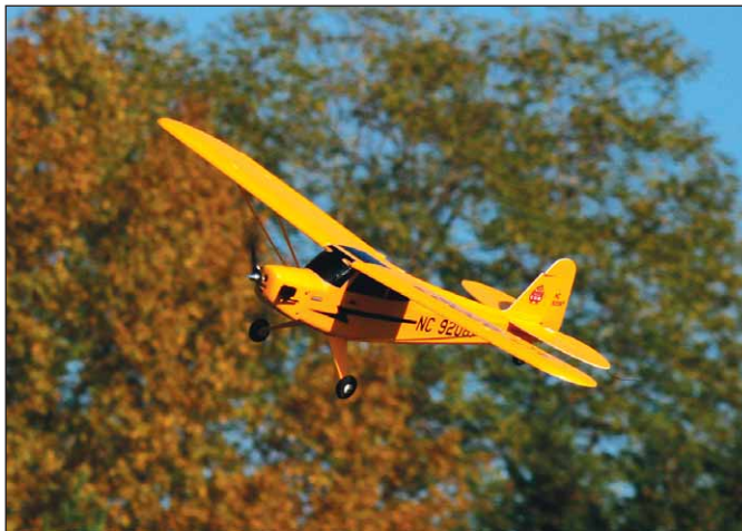
FlyZone's Cub handles beautifully. This compact, electric-powered airplane is convincingly realistic in flight.

The FlyZone Cub is an ideal airplane for beginner to intermediate sport fliers, and it makes a very respectable