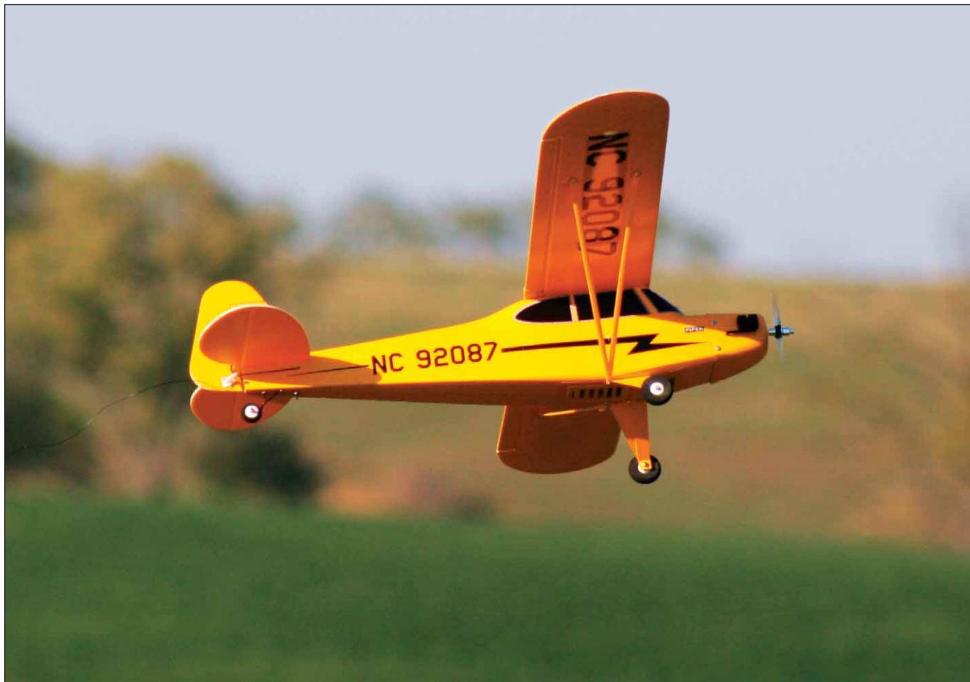
FlyZone's Piper J-3 Cub flies as good as it looks. The Cub is an ideal scale-like model for fun loving park pilots.

For additional information about the FlyZone Piper J-3 Cub RTF, see the ads on pages 9, 57 and 72, visit www.bestrc.com on the Web, or call Great Planes Model Distributors in Champaign, Illinois, at 217-398-3630. HM