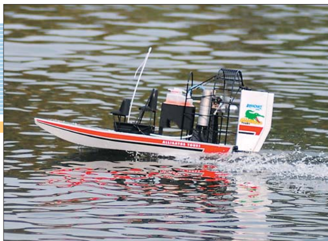
Alligator Tours gets on the step almost immediately, and has unexpectedly high top-speed performance.

Once you have the engine fine-tuned, walk the boat to the water's edge, making sure to keep your hands away from the propeller, and place the boat in the water. The Alligator Tours is so cool to drive, and very different from conventional boats in that it doesn't use a water rudder.