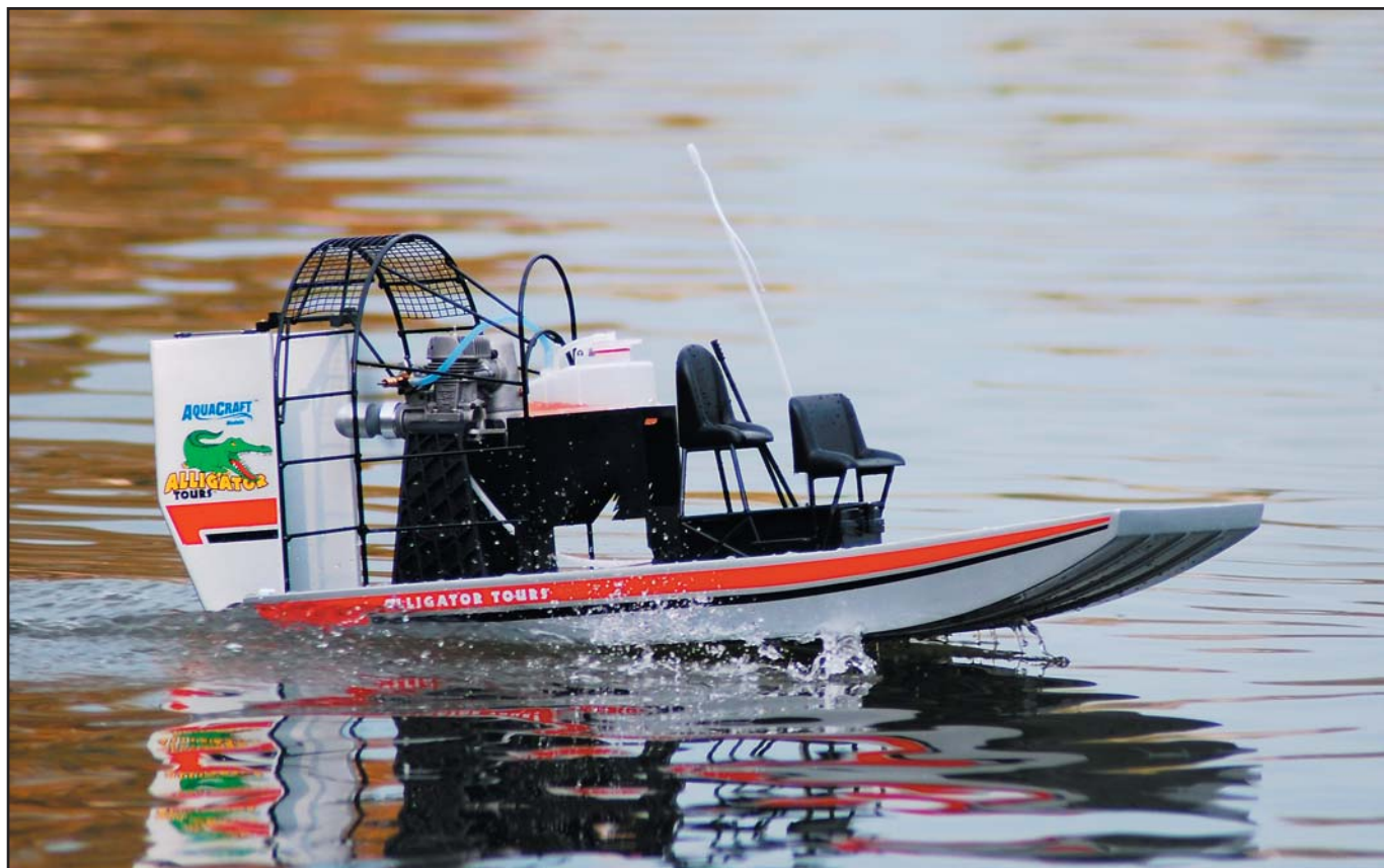
Alligator Tours looks great on the water, and also runs well over wet grass, snow and similar slick surfaces. This boat is a blast to drive.

Every drive is full of excitement and surprise. Also, it's great for improving your driving skills because the different handling lets you to build on what you already know. Alligator Tours is an awesome RC boat that will fascinate you more and more with every run. HM