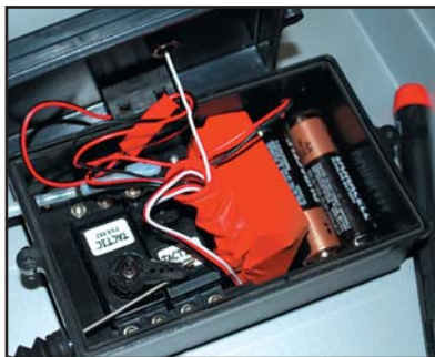
Water-resistant radio box is easily accessible, right under the deck chair. Receiver is balloon wrapped. Easy-fill tank holds 10-15-percent airplane fuel.

Getting the sleek Alligator Tours air boat ready for excitement on the water is super easy. So easy, in fact, that my dad and I prepared our review model right on our living room in a little less than 10 minutes. This is a clean and simple design, and one thing I love about a nitro or gas boat is that you don't have to charge anything. You do, however, need 12 AA batteries, and you will also need model airplane fuel, a glow driver and an electric starter for the engine.