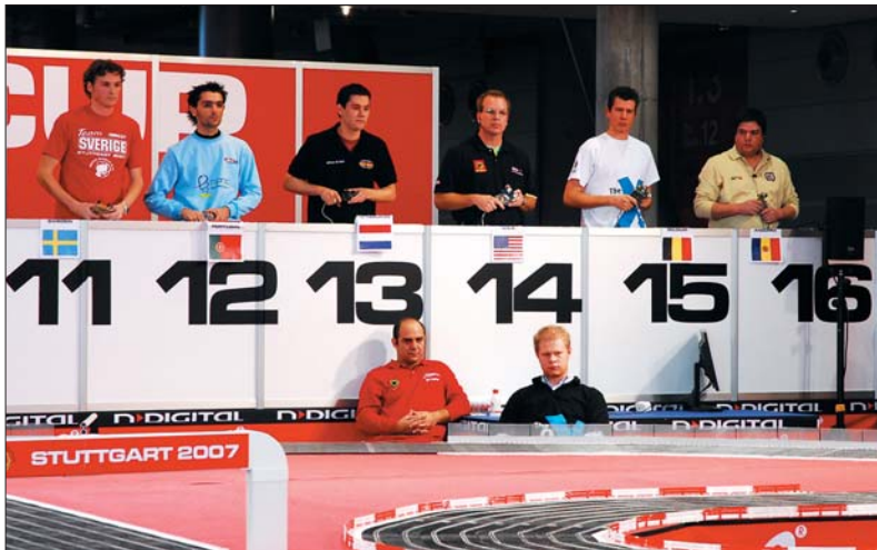
NINCO World Cup 2007 final races were held in Stuttgart Germany.