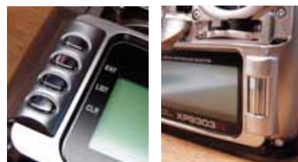
Menu access is through top two buttons. Side roller increases/decreases values.