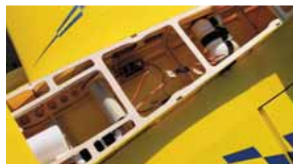
FuntanaS 90 ARF radio bay has ample room for RX, battery and throttle servo.