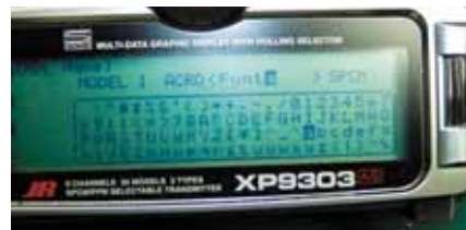
No more guessing! Entire character list is displayed on LCD screen during setup.