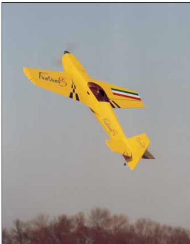
FuntanaS 90 ARF performs a sharp vertical climbout following a short takeoff. Saito 100GK provides ample power for 3D flight.

High rate is a different story, and wow, what a difference! The elevator proved a bit too sensitive for my taste, so a greater degree of exponential (60 percent) was programmed into the 9303. Once the change was made, it was much easier for me to manage the elevator in high rate.