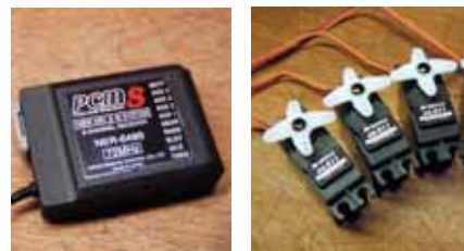
649S PCM receiver and JR 811 digital servos are standard in deluxe air set.