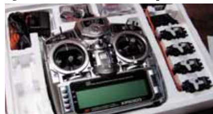
Complete XP9303 RC system, ready for installation into the FuntanaS 90 ARF.