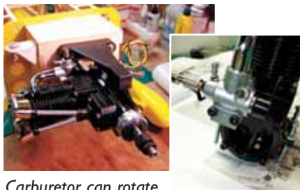
Carburetor can rotate to assure optimum throttle arm location