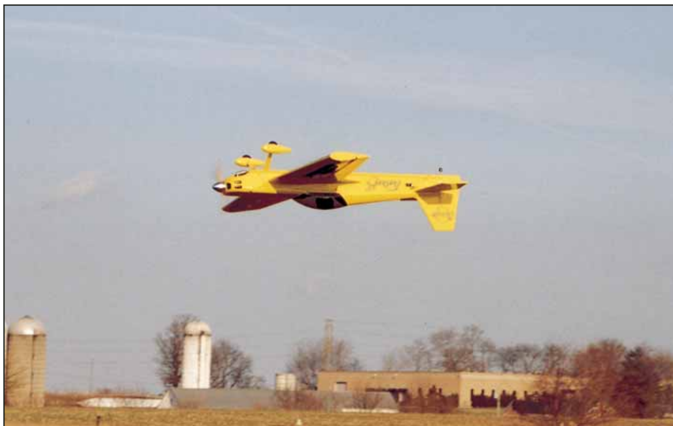
Down the flightline inverted, Hangar 9's FuntanaS 90 ARF shows a small piece of its almost unlimited aerobatic capabilities.

For more information about the Hangar 9 FuntanaS 90 ARF, the Saito FA-100GK four-stroke engine or JR's new XP9303 computer radio system, see the ads on the next page and page 5, or telephone Horizon Hobby in Champaign, Illinois, at 217-352-1951. HM