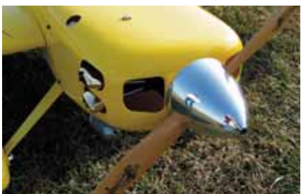
IM Products chrome spinner and Zinger 15-6 propeller complete S90's nose.

position or engine torque. At full throttle, the model rotated in 20 to 25 feet. Even though this plane hadn't yet been flight trimmed, I couldn't resist pulling the nose up and rolling vertically into the sky.