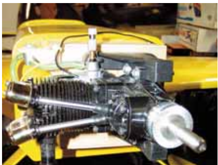
Completed engine compartment, ready for cowl trimming and installation.