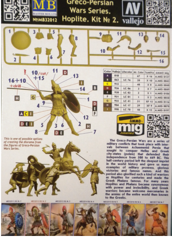
Detailed painting instructions

First up are 1/32-scale warriors from the Greco-Persian Wars that raged from 499-449 BC. There are seven kits in the series and displayed together, they'd make an excellent historical exhibit. We'll look at three of seven kits: MB 32011, MB 32012, MB 32013. All are Hoplites, citizen-soldiers from the ancient Greek city-states. They were often armed with a spear and shield, like the three represented in these kits. Each kit has different parts to build the warriors in