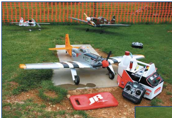
Hangar 9's new P-51 Mustang PTS was part of a very pleasant "Horizon Hobby Day" at the Lancaster County RC Club flying site for HM's Jeff Troy and contributing writer Harris Malkin. Hangar 9 flight box and field accessories, JR knee pad, E-Flite Tribute foamy, Hangar 9 P-40E Warhawk and JR 6102 transmitter in background. Photo at right shows Mustang PTS ready to go for its maiden flight — what a great look for an ideal primary trainer!

care on the elevator to track true. The model gradually built speed, lifted the tail when it was ready, and broke ground with a slight nudge of up elevator. The takeoff couldn't have been more controlled with a boxy trainer, but we just watched it happen with a heavy metal fighter. Could this be a turning point in RC flying? Absolutely!