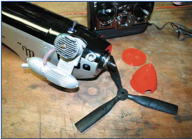
Evolution TPS Trainer Power System comes factory installed. This engine provides ample power for basic training and intermediate flight — three-bladed airscrew looks great, too..

Flaps, tail group and front end behind me, the final step to completion is installing the main landing gear. These units are completely ready to go, and come with the speed brakes already attached with nylon zip ties. The brakes must be rotated so the flats face into the airstream, then the gear is inserted into the wing slots and retained by typical straps and screws.