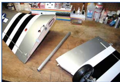
Factory-built and covered wing panels slide together over aluminum joiner. Landing gear strap and two screws prevent separation.

bold a challenge. I knew the result would be good, although I didn't realize just how good it would be until I had my hands around the transmitter. This model rocks.