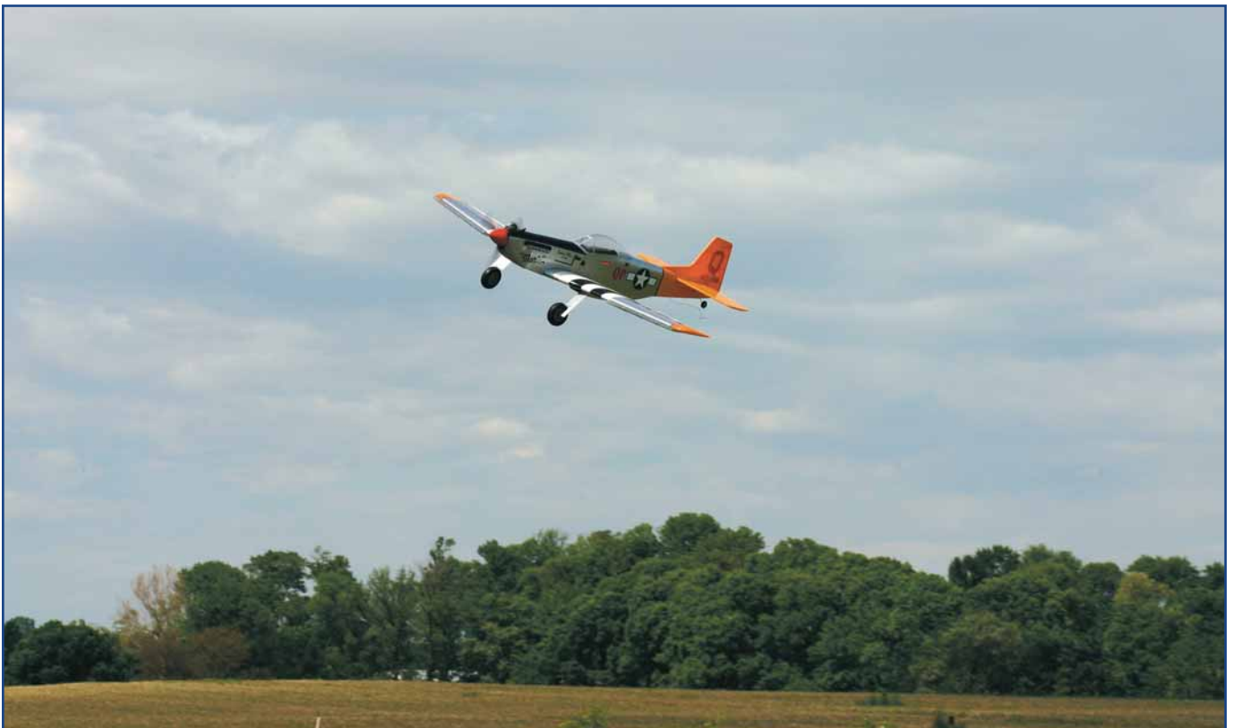
Hangar 9's P-51 Mustang PTS (Progressive Training System) flies as gently as typical high-wing cabin designs — but it's a Mustang.

For more information about the new and innovative Hangar 9 P-51 Mustang Progressive Training System, see the ad on pages 6 and 7, or telephone Horizon Hobby in Champaign, Illinois, at 217- 352-1951. HM