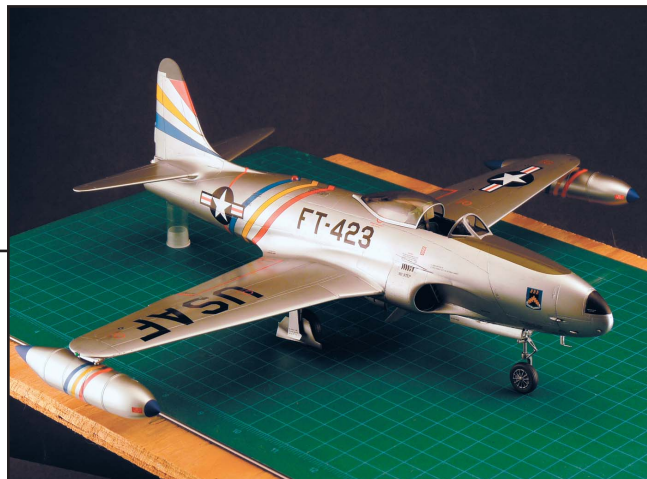
Multimedia kits benefit from different tools and techniques to get a great looking model of a historically significant aircraft..

It's hard to overplay the importance of dry-fitting; testing the parts fit before applying adhesives. This is particularly true with a complex model like the Czech Models F-80C. Parts that fit together well take less glue and less filler, and the finished model usually looks better. The trick to getting the best fit is removing flash and sprue points effectively. For styrene parts, good sprue cutters like the new model from Xuron get builders started correctly.