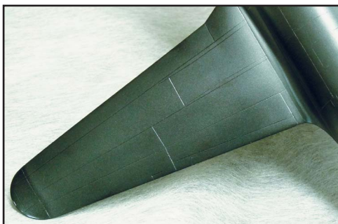
Gloss paint and metalizers require smooth surfaces, so base coat, sand, then coat again.

Then, sprue and flash can be removed safely with sanding sticks like the Excel #55678; blue and green are the ideal grits. A short, curved blade like the Excel #12 works well for shaving sprue points and scraping (adzing) flash.