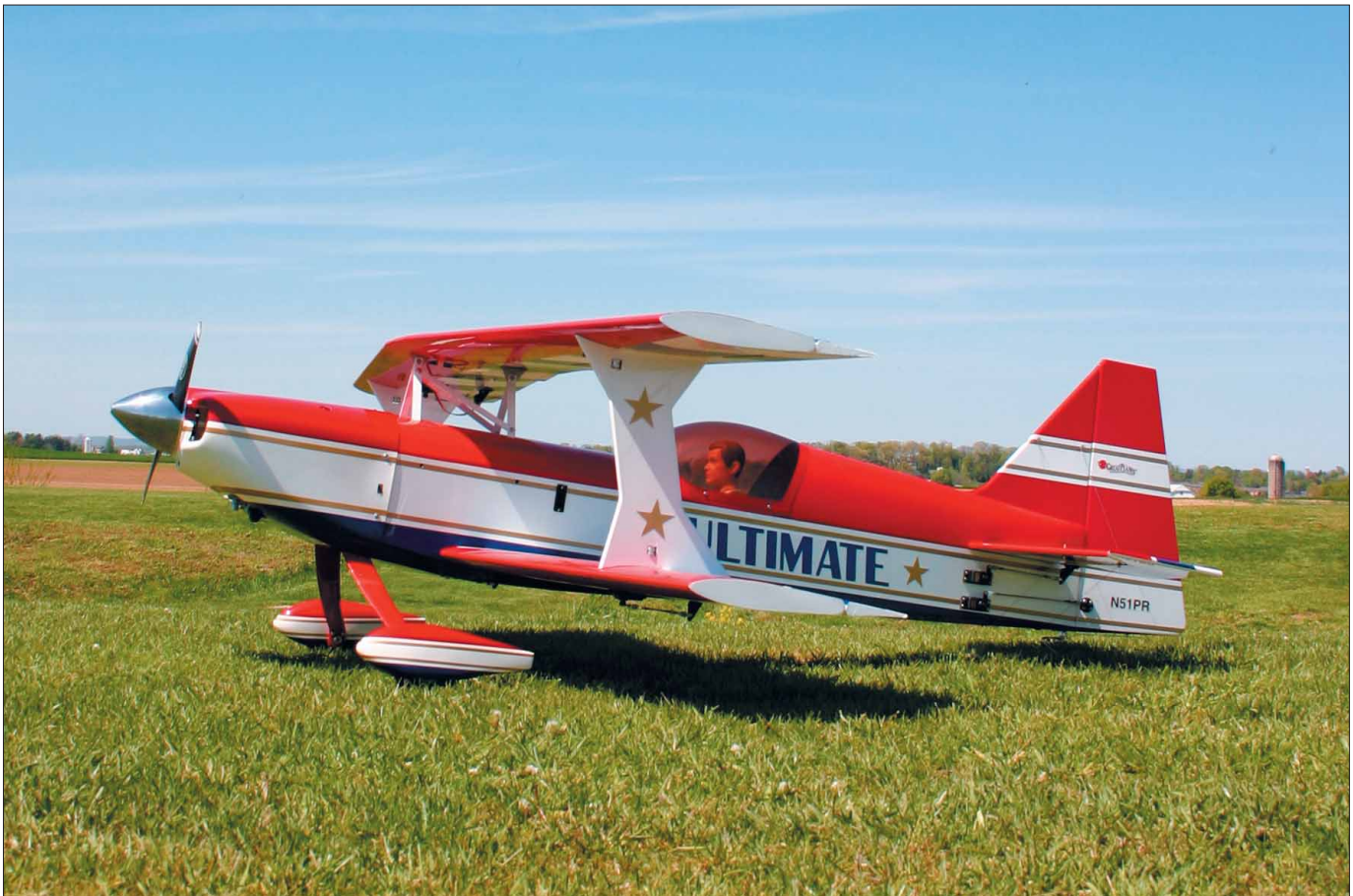
On the ground or in the air, Great Planes' 65-inch Ultimate! Biplane 160 ARF is a beautiful aerobic airplane.

For more information about the Ultimate! Biplane 160 ARF, the Fuji BT-43EIS engine, and Futaba radio systems and accessories, see the ads on pages 7, 53 and 72, visit www.bestrc.com or contact Great Planes Model Distributors in Champaign, Illinois, at 217-398-3630. HM