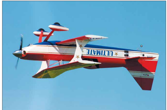
Inverted flight is also smooth, the mirror image of upright. Roll rate is very fast. Huge rudder area delivers better than average knife-edge performance.

permitted to get too slow or mushy. The GP Ultimate! Biplane and the Fuji BT-43EIS on a Mejzlik 19-10 propeller delivers ideal performance for AMA or IMAC Pattern pilots. I took my turn at the sticks with complete confidence, and I was rewarded with a very nice flight.