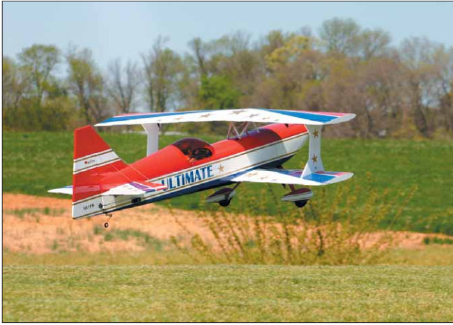
Takeoff is smooth and stable. The model is light, but rock solid and responsive. Expo is at -50 percent.

make the initial flight. Throttle easing forward, the big Ultimate! Biplane cruised down the runway, lifted its tail and gracefully broke ground. The airplane is stable, but will handle any traditional AMA rulebook maneuver with style and grace. The roll rate is terrific, and adequate rudder and elevator deflections assure that inverted and knife-edge flight are also rewarding.