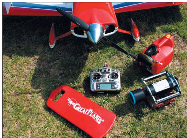
Field support items included Du-Bro gas container with Slimline Products manual gasoline pump, Sullivan Model 4 Mega-Torque electric starter, Futaba 9C transmitter and Great Planes knee pad.