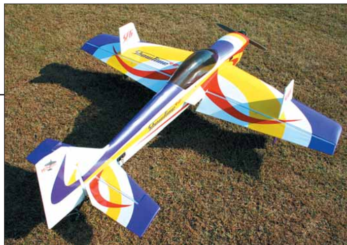
Bright scheme and large flying surfaces assure the highest visibility.

Like all Hangar 9 ARF kits, the Showtime 4D 90 goes together quickly and requires nothing out of the ordinary to complete. After getting all the control surfaces