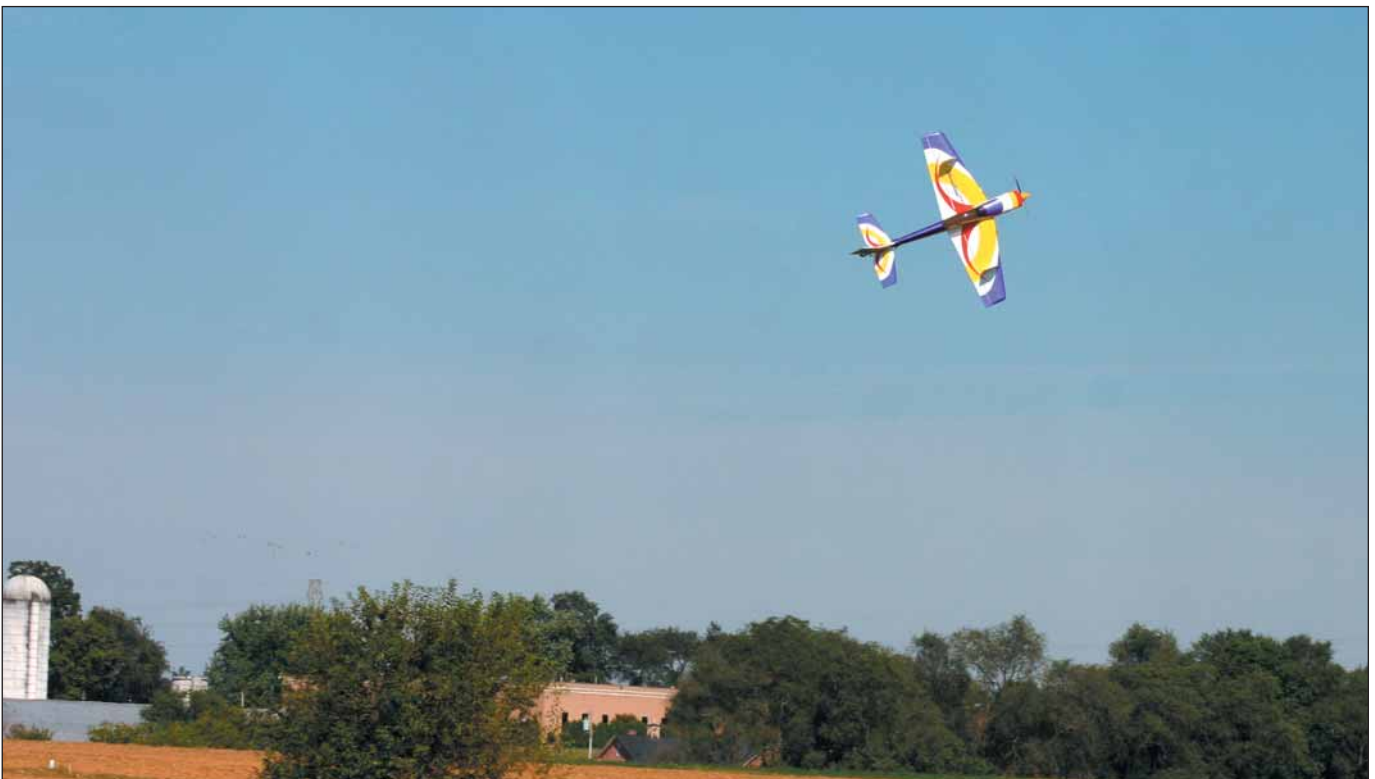
Showtime 4D in knife edge attitude over the runway. This airplane is one of designer Mike McConville's finest advanced 3D machines.

The showtime 4D flies equally well with the SFG's removed and the plugs installed. It still performs knife edge flight, as well as any other maneuver. It just takes a little more rudder in knife edge without the SFG's. From its great looks, laser-cut factory-assembled airframe, UltraCote covering, rugged landing gear and super smooth flight characteristics, the Showtime 4D is one of the best aircraft models I have ever owned. HM