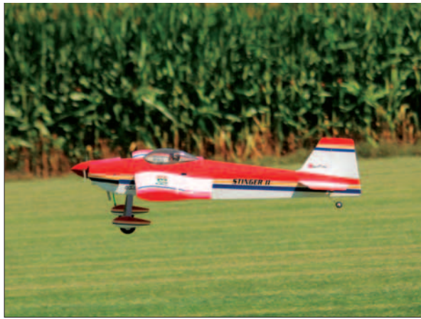
As with the original Stinger, simply chop the throttle and the airplane slows to a crawl for landings.

Assembly of the Stinger II went smoothly. No prob-