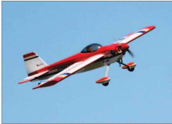
The color scheme is bright, allowing for easy visual orientation during flight.

lems needing further explanation were encountered. The instruction manual is complete and loaded with photos to assist the builder. Thankfully Great Planes did not post a “can be completed in” time on the box or in the manual. Every modeler builds at his own pace; this shouldn’t need any further dialog. After what seemed like an eternity to adjust our schedules, I was able to meet with Ed Rogala for flight evaluation and photos. Once at the flying field the OS was started and tuned for peak performance, and the model was placed on the flightline. The controls were checked for proper operation one last time, and test pilot “Fast Eddie” applied some throttle. The Stinger II was airborne almost immediately. A few trim passes later, Ed began to wring the airplane out. As the fuel tank emptied, the airplane was landed. After replenishing the fuel, it was my turn.