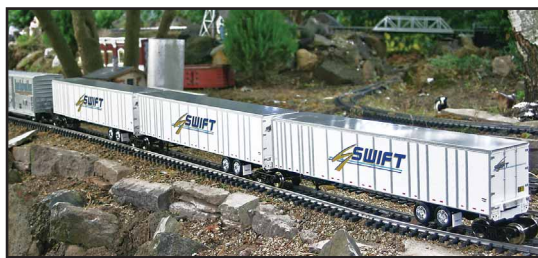
A trio of RoadRailers arrives on the end of a string of Aristo 53-foot Evans box cars. They may be as long, but they aren't as wide, nor do they have the height inside. Neither do they have the weight rating. As a result, they're less costly to haul.

Aristo designed the trailers to be converted to a highway trailer appearance. First, the bogey box is removed following the instructions. As it goes, so goes the railroad-related stuff. Next, the highway wheels on one end of each axle are removed and the axle is repositioned through the alternate holes, setting it at highway height. Third, the rear bumper is swapped out between the included folded up and down models, then the drawbar tongue is removed. All of this involves removing three screws from the trailer bottom and separating it from the van shell. You will be installing the support brackets of the landing gear by simply snapping them into place, and you have your choice of extended or retracted landing gear. Extended gear is for a parked trailer; retracted is for rail or tractor service.