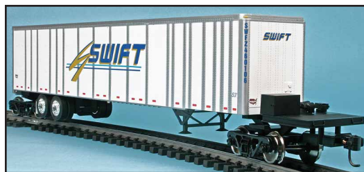
The RoadRailer is coupled to a regular train via a Coupler Mate, shown on the front of this car. This is also how the single pack cars are delivered.

Meanwhile, the tractor on the front is pulled off and the landing gear is raised so that the next bogie can be pushed into position. Then, the landing gear is retracted and the trailer is now an official part of the railroad car. The rear bumper of the truck has actually been folded up so that the rear doors cannot be opened. There is no slack in the mounting system and the trailers are so