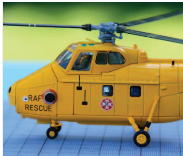
With such high-quality at an attractive price-point, the Westland Whirlwind will be very desirable.

The Corgi Aviation Archive Westland Whirlwind is a model of XJ729, a turbine powered Mk10 version that entered service with Royal Air Force No. 22 squadron in 1962 and remained on active duty until it was withdrawn from service in 1981. The full-scale helicopter was later