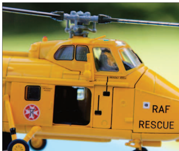
The markings are crisp and well executed. There are a number of fine details that can only be discerned through the use of a magnifying glass.

The right side of the helicopter has a winch in the proper location, but it is a simple a cast metal replica