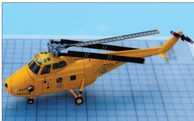
One of the two included rotor heads allows the main rotor blades to be displayed in their folded position.

During 1950 the Royal Air Force purchased its first H-19 Chickasaws directly from Sikorsky Aircraft Corporation in the US, but Westland Aircraft quickly obtained a license to manufacture the type in Great Britain. Like the American models, the first Whirlwinds were powered by Pratt & Whitney radial piston engines. The Whirlwinds were assigned a number of roles, including coastal command, antisubmarine warfare and search-and-rescue missions.